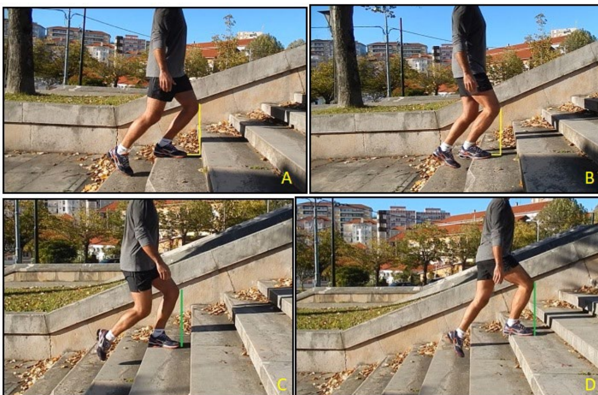
Figure 1: Representation of the climbing stages and limit line marking from the toes to the knee. A and B: going up the stairs, step by step. C and D: climbing stairs two at a time. The yellow lines mark the knees beyond the anterior limit of the feet. The green line represents the boundary between the imaginary line between the anterior to the knee and the toes.

After the patient's physical examination, the dynamic evaluation of the movement's kinetics was performed, in which the patient was asked to go up and down stairs (Figure 1-2). The images were analysed on the computer, showing the frontal translation of the knee from the anterior tibial line to the line formed by the ipsilateral feet' fingers. This was achieved using a video camera and removing the moment of the previous translation from the image.