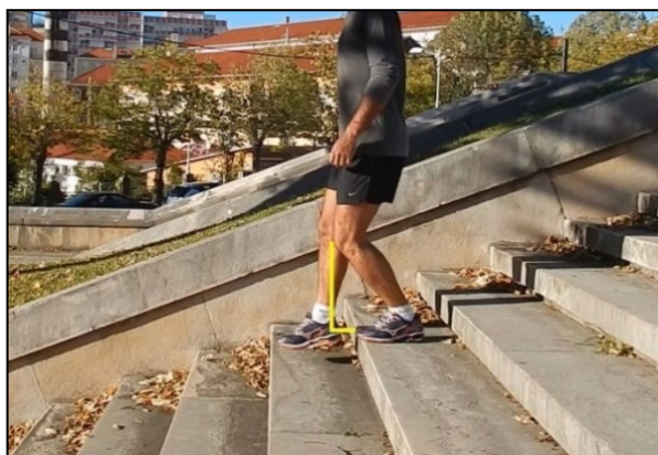
Figure 2: Knee joint damaging angles representation, present in the act of stairs descending. The yellow line represents the distance between the fingertips and the anterior part of the knee. It shows that the knee is in front of the anterior line of the ipsilateral foot